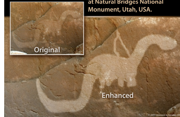
Native American petroglyph under the Kachina Bridge at Natural Bridges National Monument, Utah, USA.

The Beast (Rev. 13:1-10) possessed King Nebuchadnezzar of Babylon (Isaiah 13-14)